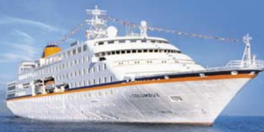
MS Columbus ★★★