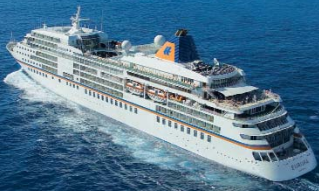
MS Europa ★★★★★