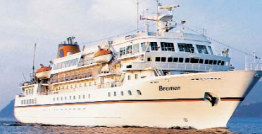
MS Bremen ★★★