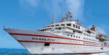
MS Hanseatic ★★★★★